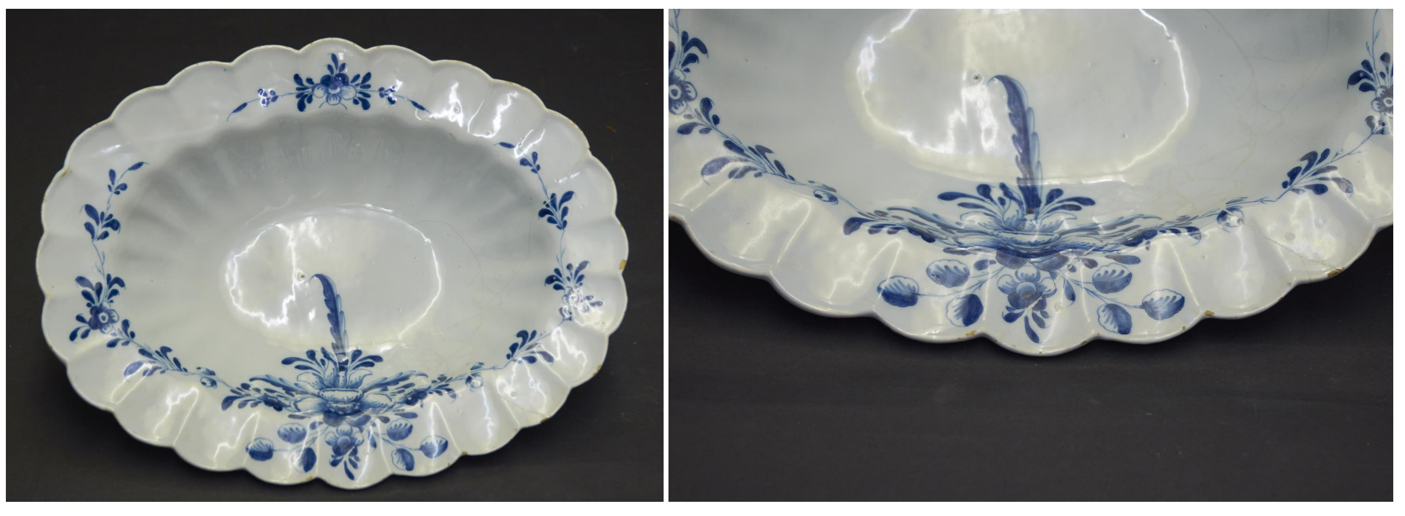
Figure 5 – Faience basin after restoration (left) and detail of the final aspect of the piece (right).

The final result of the restoration process is showed in Figure 5.