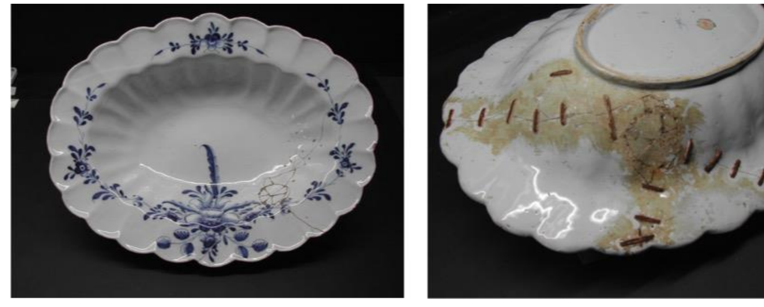
Figure 1 – State of conservation of the faience basin prior to restoration.

Fragments were sealed and bonded using Paraloid B72 in acetone, ensuring compatibility and durability in the restoration process. Each fragment was meticulously checked for cleanliness under a magnifying loupe before its assembly. The assembly process is showed in Figure 4.